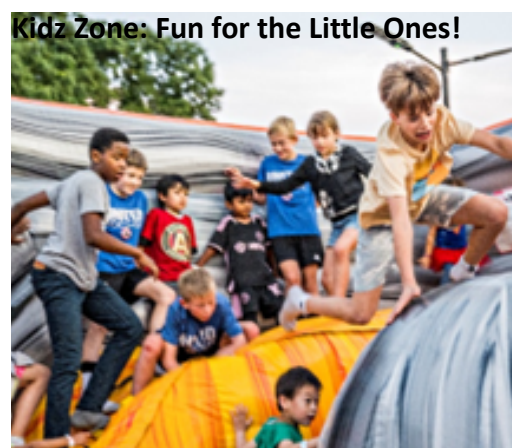
Kidz Zone: Fun for the Little Ones!

For the first week, fans can enjoy special early bird discounts, including 30 TasteBucks for only $25 and a bundle of 3 Kidz Zone wristbands for $10 each ($30 total). Early bird discounts on TasteBucks and Kidz Zone wristbands will be available until April 20 at 11:59 p.m.