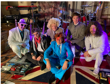
Her Majesty's Request