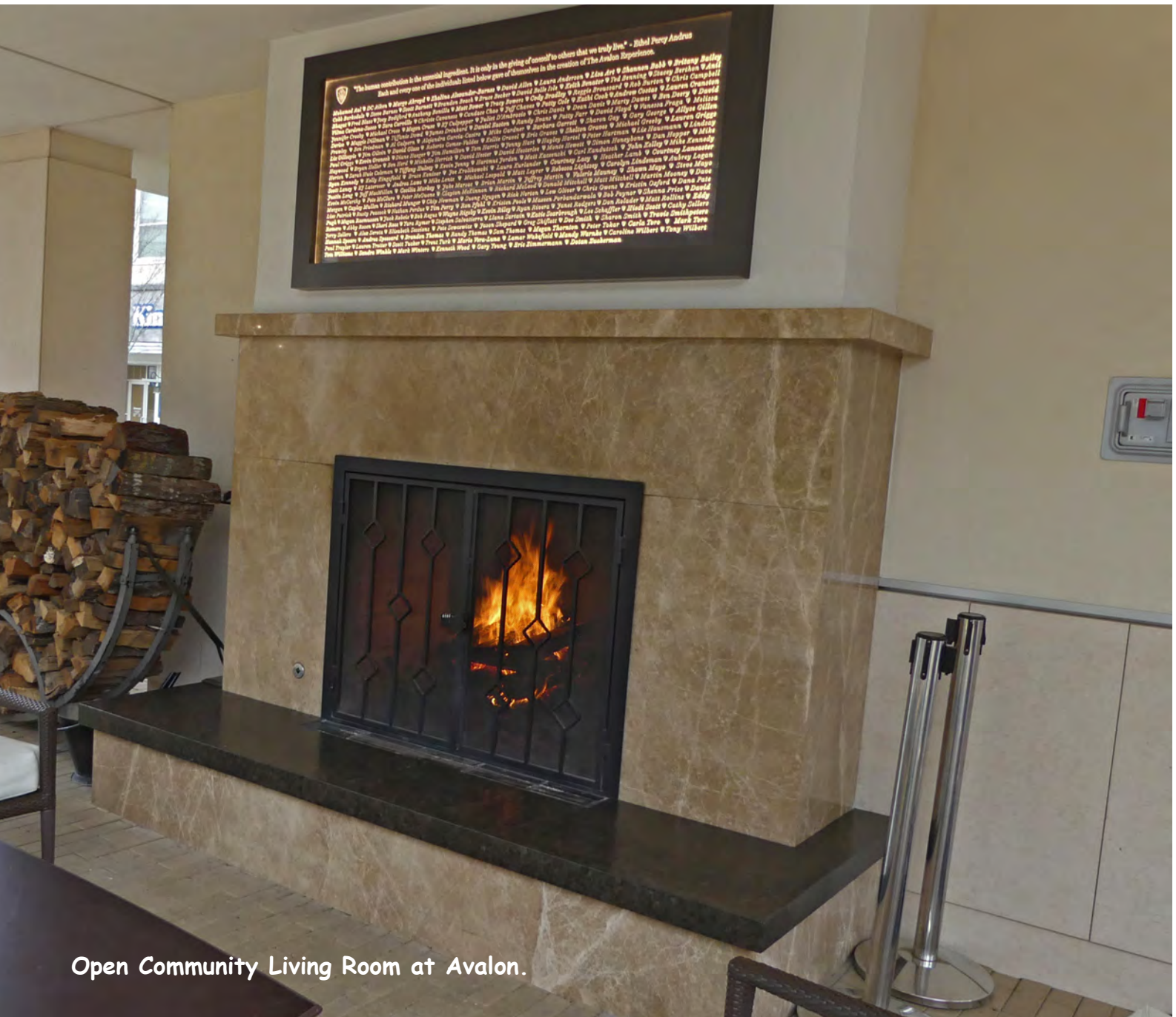
Open Community Living Room at Avalon.