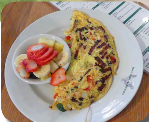
Three egg scramble at Bantam and Biddies

Zagster where you can get an app and enjoy the first three hours free then a low payment per hour