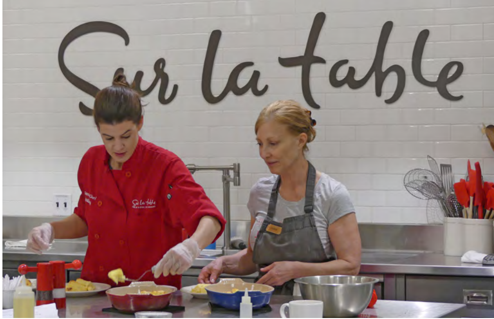
Chef and her assistant prepare food at Sur La Table.

Area for youngsters under six where parents can relax while children enjoy the custom play area and a family lounge complete with a spot of nursing mothers. The playground has its own soft play squirrels in keeping with the theme of Avalon.