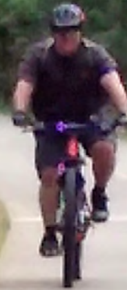
Biker on Big Creek Greenway

Zagster where you can get an app and enjoy the first three hours free then a low payment per hour