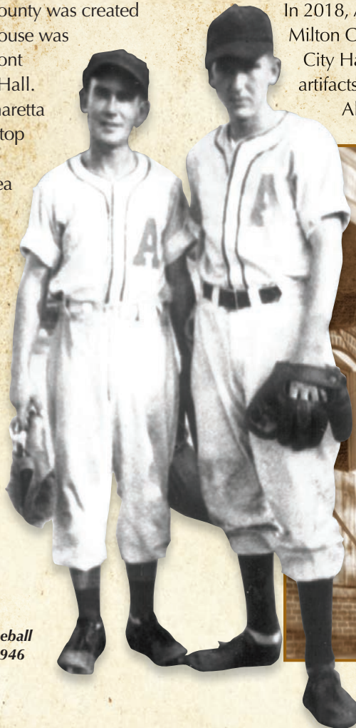
Alpharetta baseball players circa 1946

In 2018, Alpharetta opened the Alpharetta & Old Milton County History Museum inside Alpharetta's City Hall to establish a permanent collection of artifacts and interpretative displays that bring Alpharetta's heritage to life.