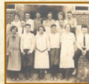
Future Historical Marker - Coming Soon!