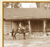
Future Historical Marker - Coming Soon!

Milton School opened on this site in January 1922 to serve students in grades 1 through 11. A 12th grade was not added until 1950. When Milton County merged with Fulton County in 1932, the school received major upgrades including central heat, indoor plumbing, a cafeteria and school bus transportation. In the 1930s, students in the Future Farmers of America also built a log cabin on campus to use as a clubhouse. Before the school was razed in 2017, the log cabin was relocated to a City Park on Milton Avenue. When GA 400 opened in the 1970s, Alpharetta's student population quickly outgrew the aging Milton facility. In the 2005-2006 school year, a new, modern Milton High School opened on Birmingham Highway. The original Milton building served as an alternative high school for several years before finally closing in 2017.