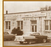
Future Historical Marker - Coming Soon!