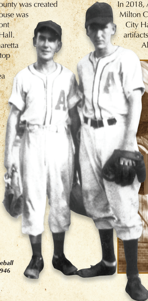
Alpharetta baseball players circa 1946

In 2018, Alpharetta opened the Alpharetta & Old Milton County History Museum inside Alpharetta's City Hall to establish a permanent collection of artifacts and interpretative displays that bring Alpharetta's heritage to life.