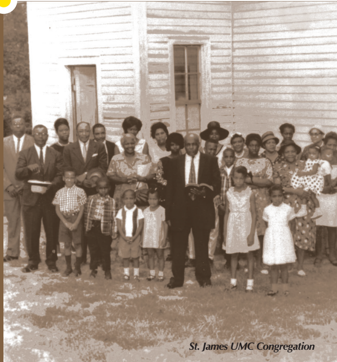
St. James UMC Congregation